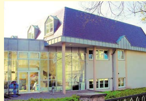
Erfurt youth hostel