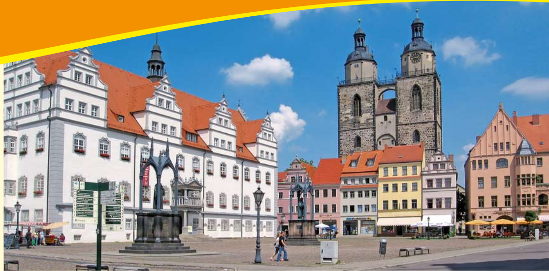
Wittenberg market square