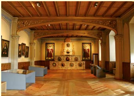
lecture theater in Luther's house